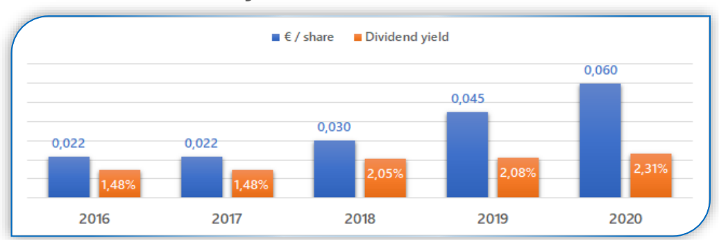
Dividend per share was restructured in previous years with the split 1:6 (12/6/2020)