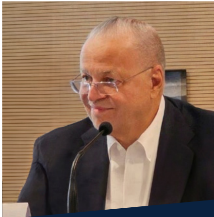
Evangelos Mytilineos Executive Chairman

The AGM is an important event in the Company's corporate calendar and represents the Board's opportunity to present to you the Company's performance and strategic priorities, to engage with you on the questions you might raise, as well as to pass the necessary resolutions for the conduct of the business and affairs of the Company. We are delighted to welcome shareholders to attend the AGM in-person in Greece. Details of the arrangements, including how to join the AGM, vote and ask questions during the meeting are set out on pages 13 to 16 of this circular. The Company may be required to modify the arrangements for the AGM on short notice. Shareholders should monitor the Company's website www.metlen.com and announcements to the London Stock Exchange and the Athens Stock Exchange for any updates to the meeting arrangements.